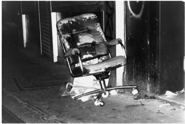
“New York was, especially back then, just a gritty, gritty place,” Wool said, “and I was interested visually in all of it.” Christopher Wool