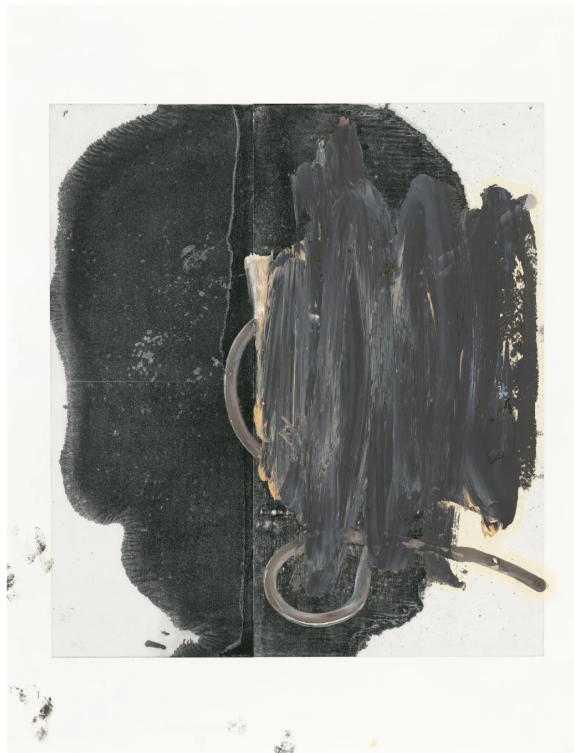
“Untitled” (2020), oil and inkjet on paper.

“I used to joke that I was a Sunday painter because I’d gotten so busy with career stuff that Sunday became the only time I actually had time to paint,” he said. “I was really at my wit’s end at the beginning of the pandemic. I had been on the treadmill for so long. And then suddenly I felt like I could just be an artist again. I just made work.”