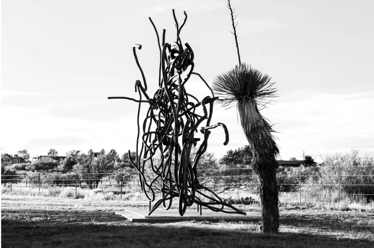
“Untitled” (2018). Wool has enlarged some of his sculptures over the years by casting them and having them produced in bronze and copper-plated steel. Christopher Wool

In 1993, Wool published his first book of photographs, “Absent Without Leave,” heavily grainy shots of urban scenes in Europe and other places where he had traveled, the photos run through a photocopier to fuzz many almost to illegibility.