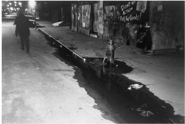
Photographs from Wool's "East Broadway Breakdown," taken between 1994 and 1995 on the Lower East Side. Christopher Wool