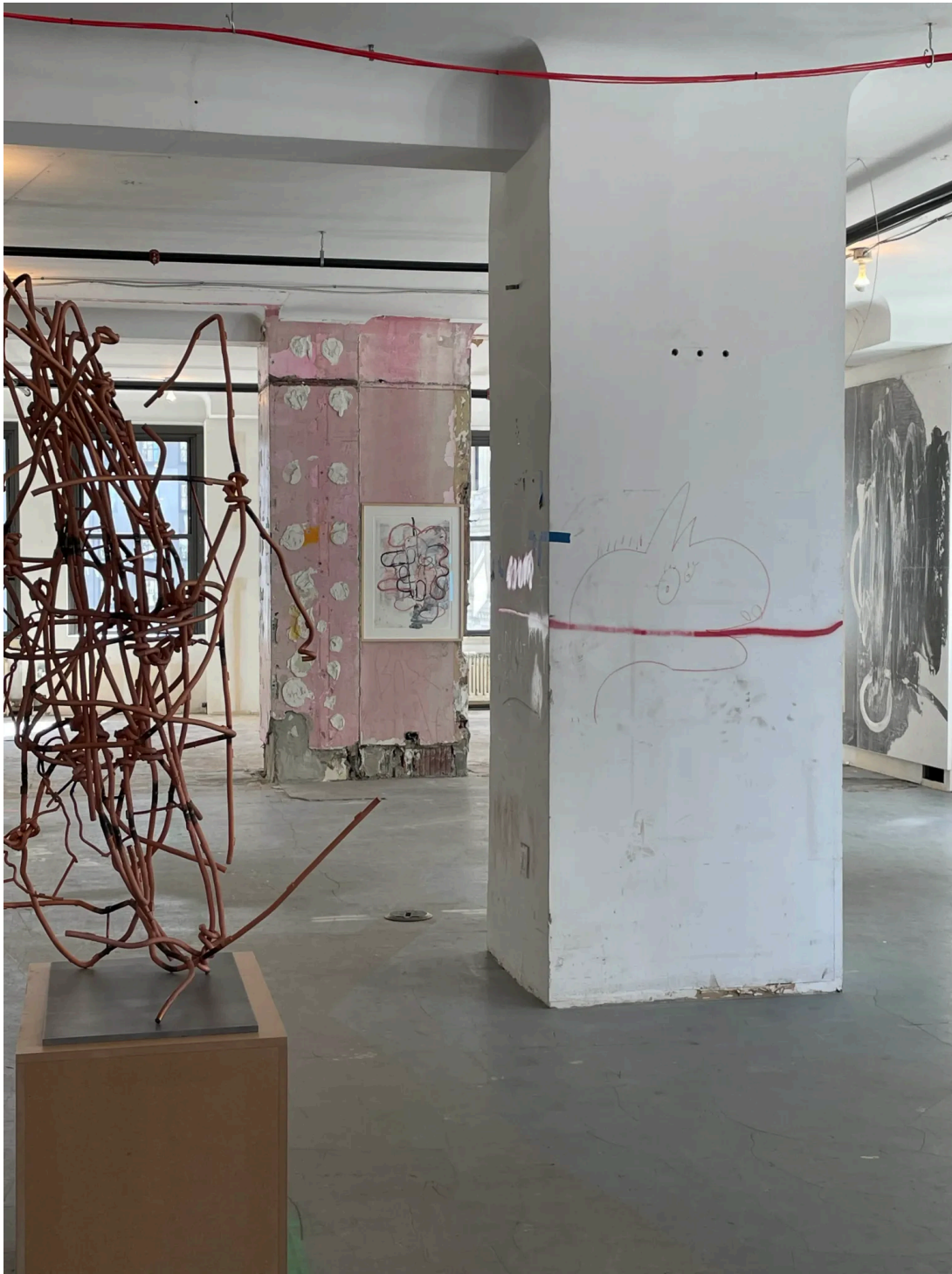
101 Greenwich Street: Christopher Wool, See Stop Run, 2024, Installation View

“Christopher Wool: See Stop Run,” 101 Greenwich Street, 19th Floor, New York, NY. Through July 31, 2024.