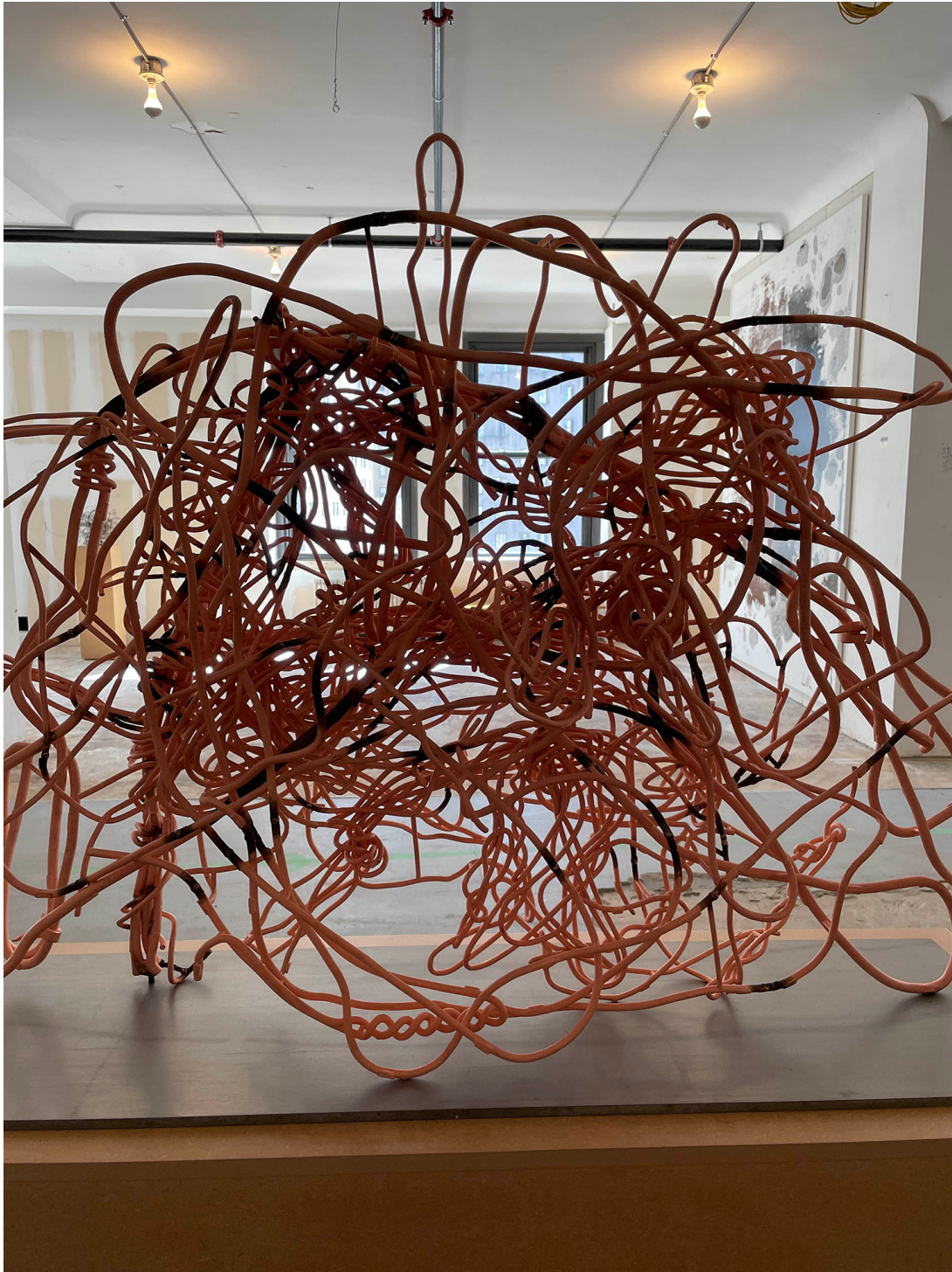
101 Greenwich Street: Christopher Wool, See Stop Run, 2024, Installation View

mechanical, the remarkable and the ordinary. The wire tangles do the work of traditional sculpture: looping arabesques sitting on pedestals, the pedestals striking an interestingly discordant note in an untraditional setting.