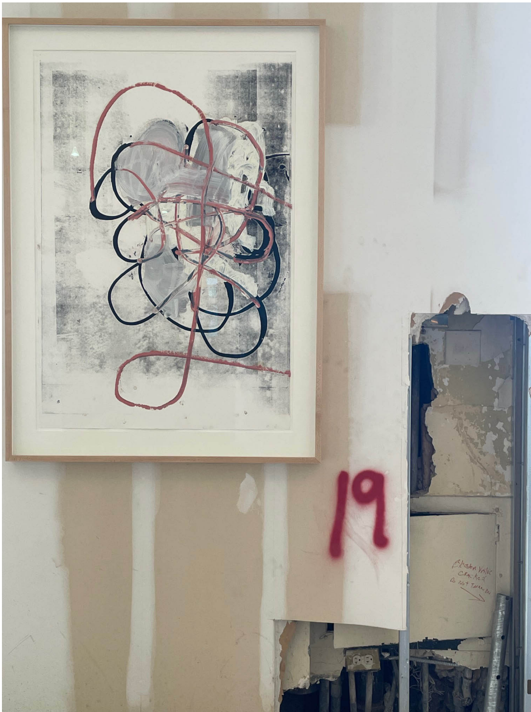
101 Greenwich Street: Christopher Wool, See Stop Run , 2024, Installation View