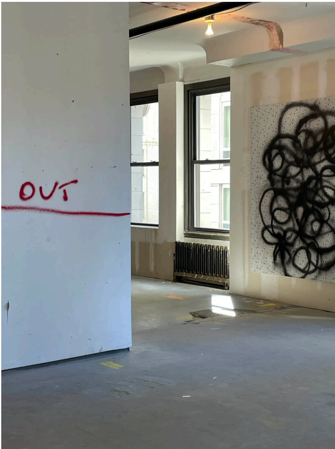
101 Greenwich Street: Christopher Wool, See Stop Run, 2024, Installation View

The site is clearly between tenants, with exploratory holes in the walls, scrawled graffiti probably left by workmen, and exposed wiring. It's the kind of raw space that once was readily available and affordable for artists to rent in NYC. Natural light fills the space through multiple windows on all four sides. It is startling just how in sync this setting is with the art on display. Wool's work has always referenced the elemental: drawing as scrawl, painting as spill, sculpture as jumbled metal. Everywhere you look the art echoes the dereliction of the space, such that space and work uncannily merge. Even while focusing on a single piece, you are aware of the exhibition in its entirety.