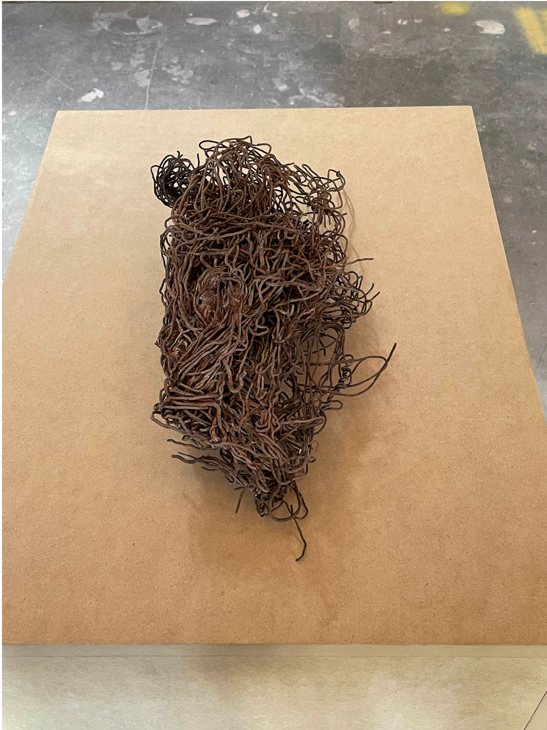
101 Greenwich Street: Christopher Wool, See Stop Run , 2024, Installation View

For the next four and a half months, Wool will be exhibiting a survey of work from the last three decades on the 19th floor of an office building at 101 Greenwich Street in Manhattan's financial district, titled "See Stop Run". It's an audacious idea, made possible in part by the glut of unrented commercial space in the aftermath of the pandemic and by so many people working remotely. The show combines painting, photography, and sculpture. There are no text paintings, which Wool has said he considers an aberration. Since the early 1990s, his work has been primarily abstract and gestural. He presents several large-scale paintings, created using silkscreens and scaled up from smaller oil and inkjet paintings that hang in proximity to the larger works.