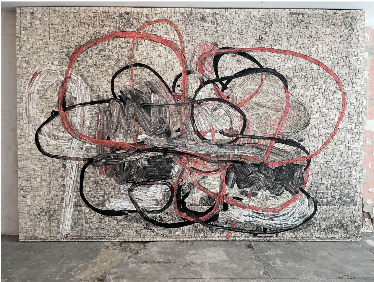
101 Greenwich Street: Christopher Wool, See Stop Run , 2024, Installation View