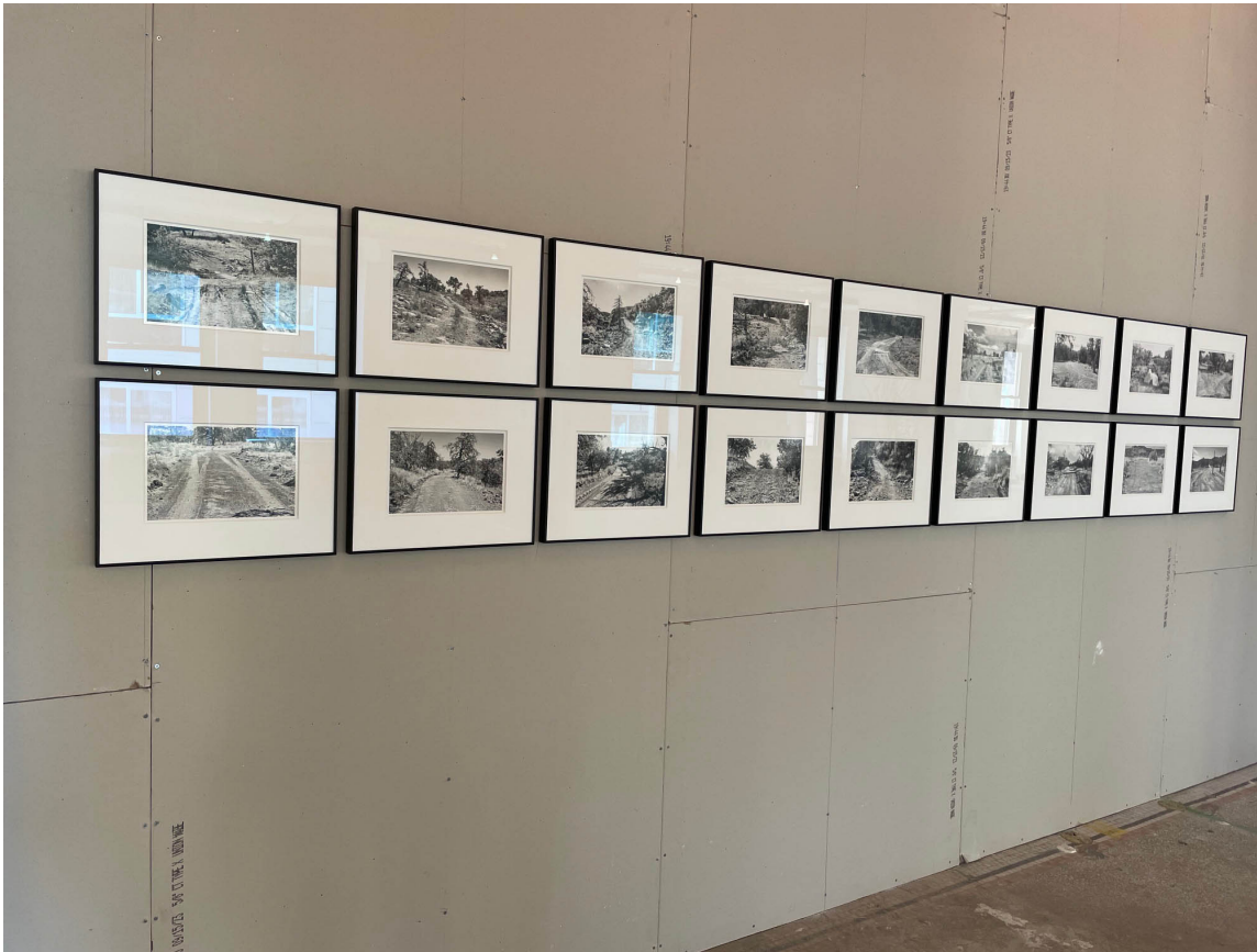
101 Greenwich Street: Christopher Wool, See Stop Run, 2024, Installation View

The silkscreen paintings evoke automatism but have been tweaked in Photoshop. A piece from 2023 may be the first expressionistic mosaic I have seen, as roughhewn as anything else in the show. I was struck by how the photography informs the rest of the exhibition. There are some examples from the series “Incident on Ninth Street” from 1997, documenting the aftermath of a fire in Wool’s studio in Manhattan, and a 2018 series centering on dirt roads around Marfa. Both series feature location devoid of people. The Ninth Street photos amplify the gutted character of the setting for this exhibition, while the Marfa photos evoke a sense of aloneness amid nature, the roads resembling drawn gestures that enter and shape an existing landscape of dirt, trees, shrubs and sky.